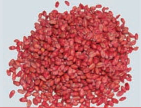
Whole Wheat Bait