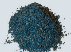
Cut Wheat Bait