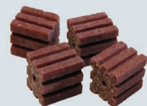
Extruded Block Bait

PROFESSIONALS IN PARTNERSHIP – CARING FOR THE ENVIRONMENT